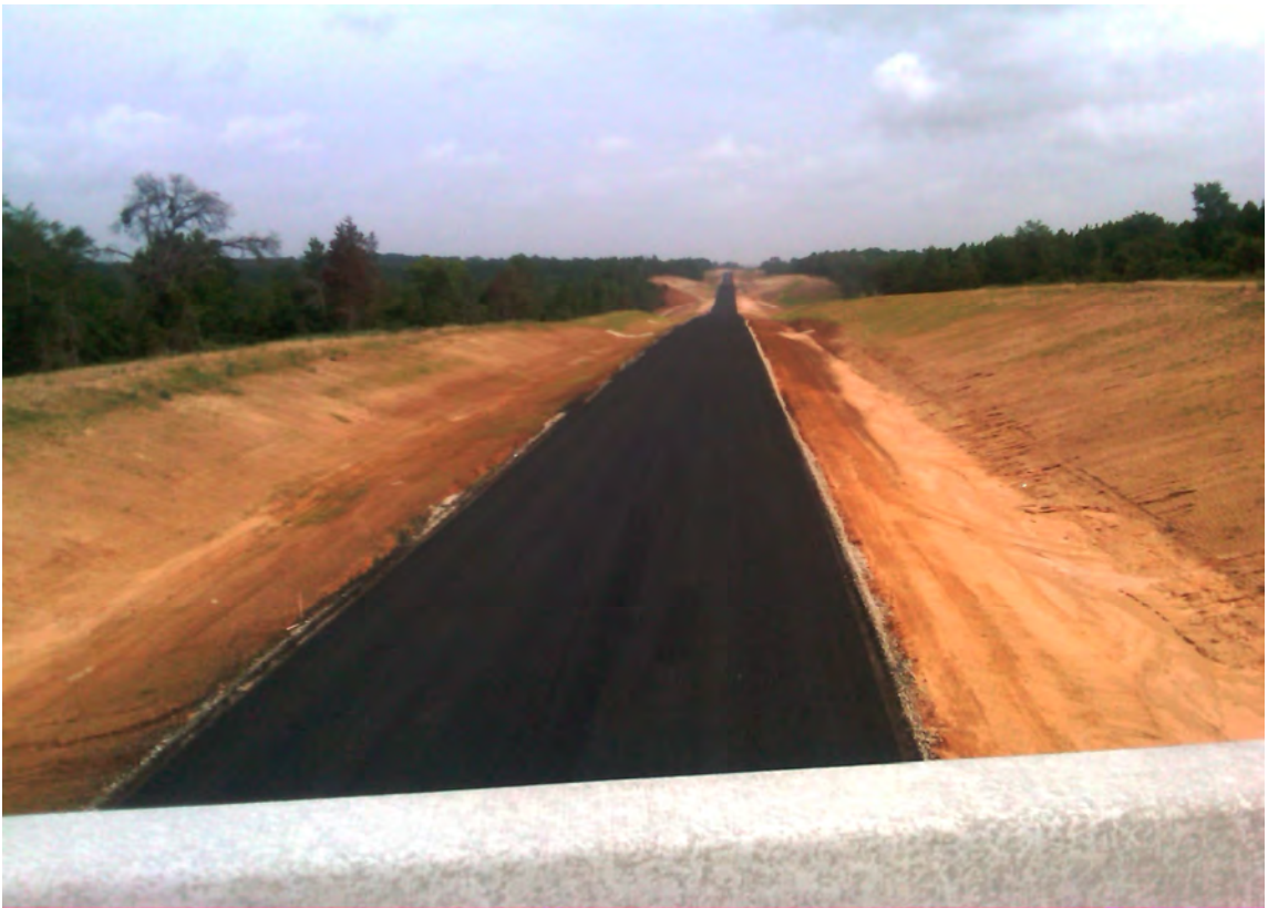
2 Looking North from CR 1145 Bridge.