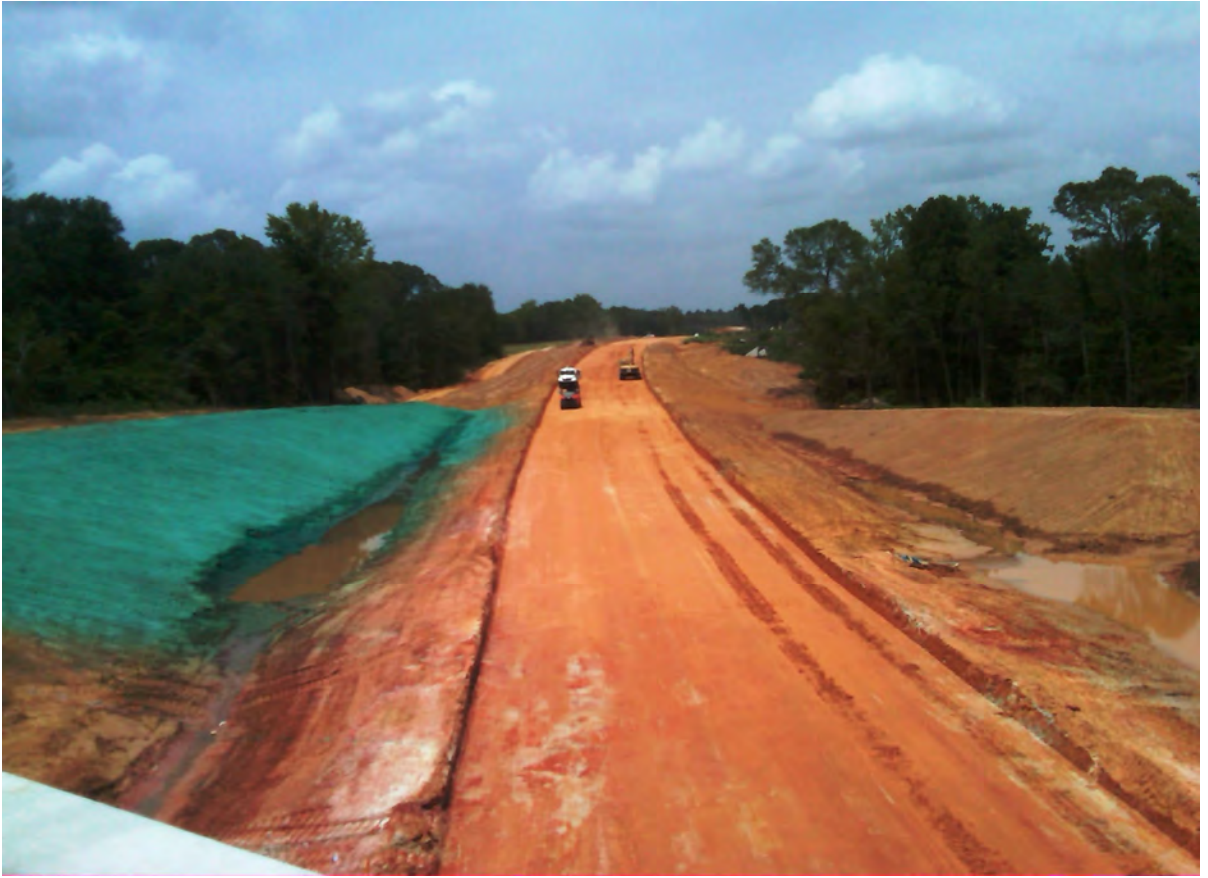
5 CR 46 looking North.