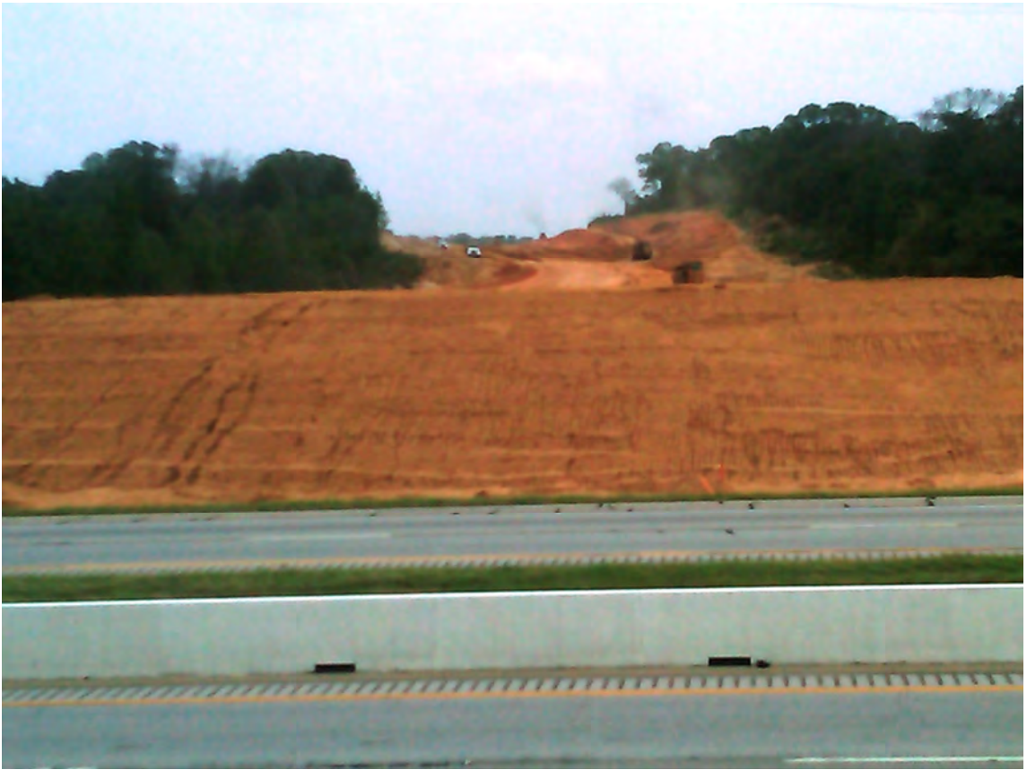
7 Looking south from I-20.