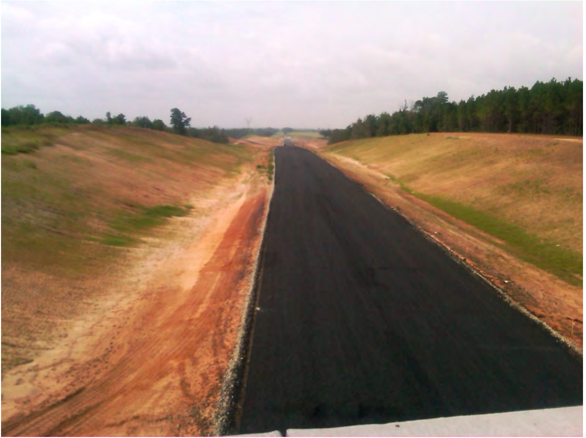
3 Looking South from CR 1145 Bridge.