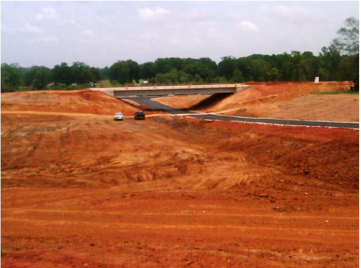
4 CR 1150 Bridge and new County Roads.