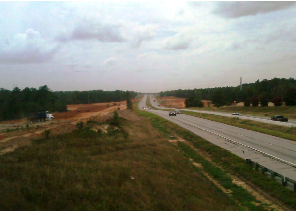
6 Embankment and ramp construction at I-20.