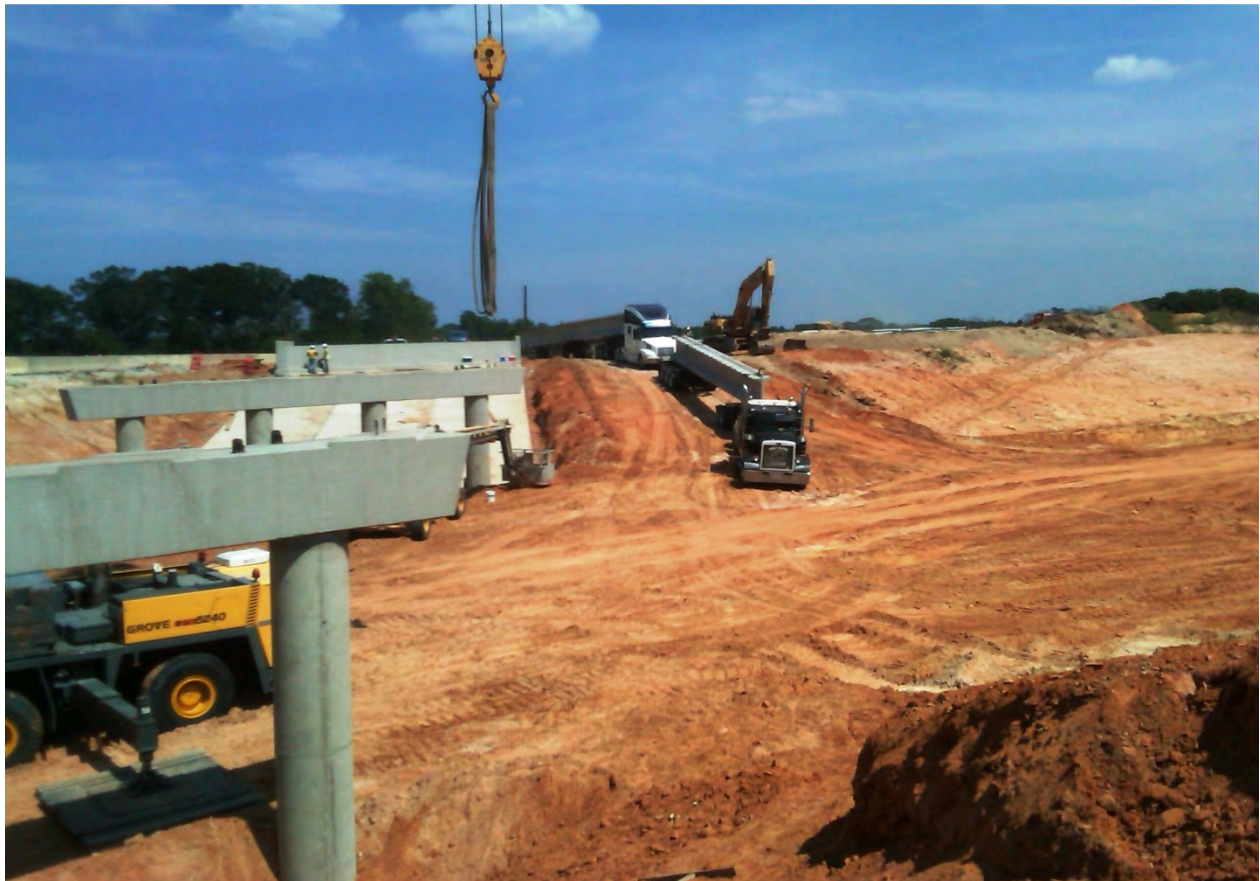
Figure 1 Precast Bridge Girders arriving at SH 110.

The construction of Toll 49, Segment 3B continued to make good progress in the second quarter of 2012. Since the last quarterly report in April of 2012, the CDA Design/Build Developer, CH2M Hill, has completed the design portion of the project and are making great strides in earthwork, drainage and bridge construction. In early June, CR 1145 Bridge has been completed and is open to traffic. FM 724 Bridge and CR 46 are nearly complete. Roadway construction elements have moved into the detailed finish grading in major portions of the project, with construction crews continuing to focus on excavation, embankment, permanent drainage, traffic control and erosion control elements. Flex base and pavement placement has begun at major intersections and along portions of the mainlines. Structural construction includes major and minor drainage structures and drilled shafts, columns, abutments, bent caps and bridge deck for bridges at multiple locations.