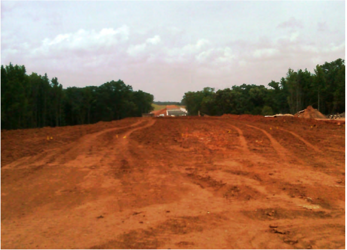
9 Looking North past Black Fork Creek.