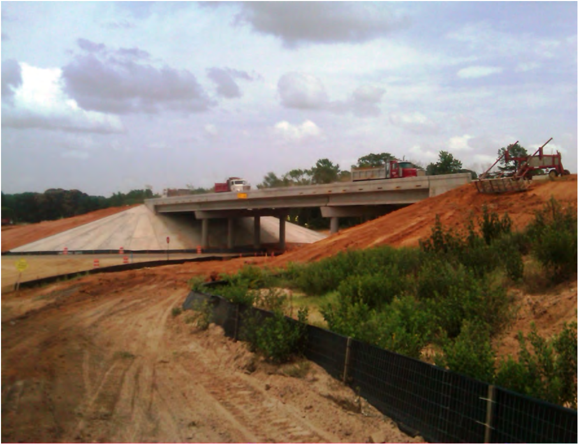
1 Construction Traffic on the SH 724 Bridge.