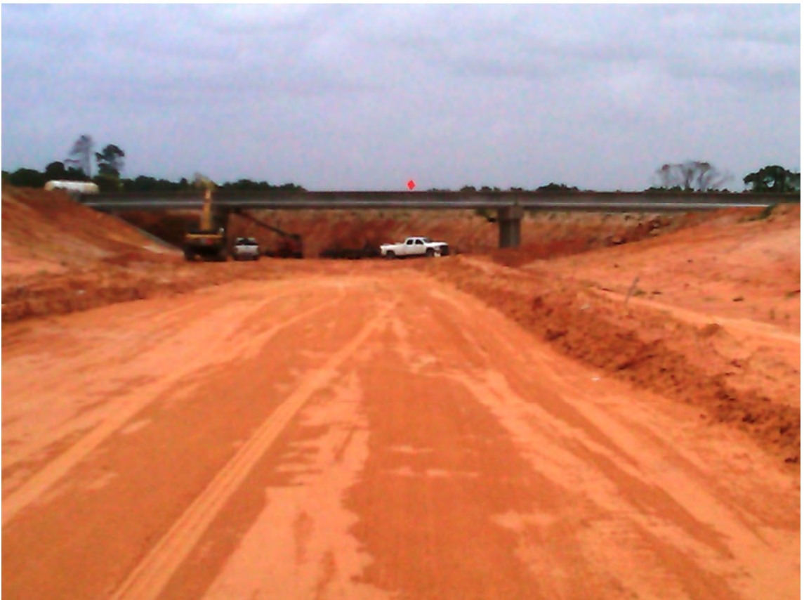
8 Girders in place on the SH 110 Bridge.