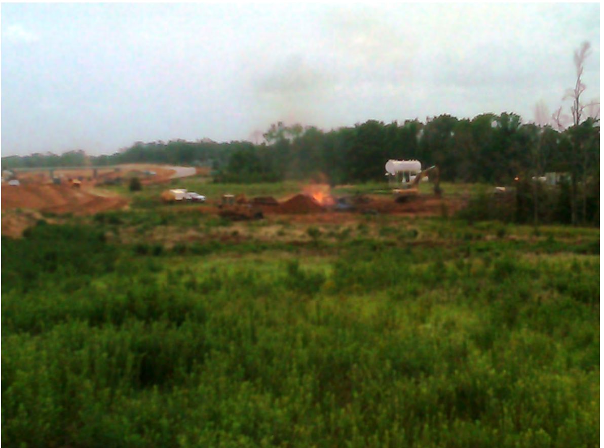
10 Trench Burning Operations.